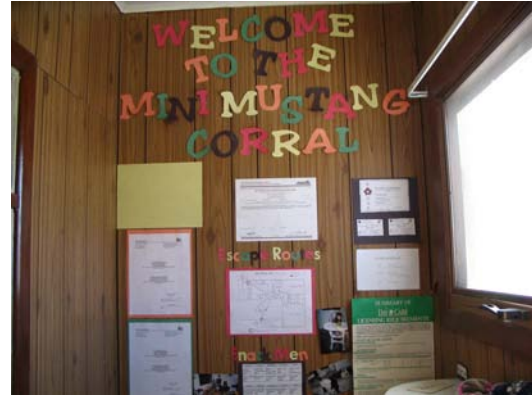
Minto Nursery/Day Care Centre

Minto Nursery/Day Care Centre Renovations, equipment, operating costs - $5,000, 1 Evening Bingo