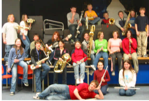
Whitemouth Senior/Junior School Band Parents Association

Winnipeg Inner City Youth Futures Fund Program enhancements at 15 inner city schools - $30,000, 30 Share the Wealth Bingos