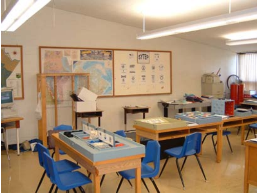
Career Connections, Brandon

Carrick Community Club Inc. Renovations - 3 Evening Bingos