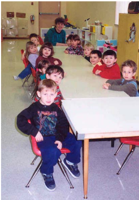
Little Day Buddies Nursery School, Lac du Bonnet

Little Day Buddies Nursery School Program costs, equipment purchase - $10,000, 1 Evening Bingo