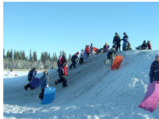
Alf Cuthbert School Parent Advisory Council, Moosehorn

Playground enhancements - $5,000, 1 Evening Bingo