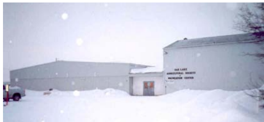
Oak Lake District Arena

Ice resurfacing machine - $9,000, 2 Evening Bingos