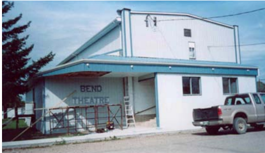
Strathclair & District Theatre Committee, Inc.

Siding, soffits/fascia, driveway, sidewalk - $3,000, 1 Evening Bingo