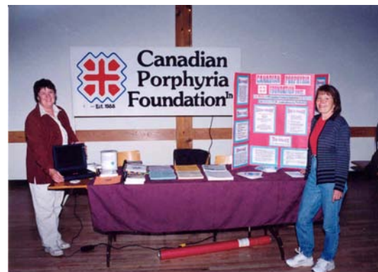
Canadian Porphyria Foundation, Neepawa

Canadian Porphyria Foundation Public Awareness project - $8,000