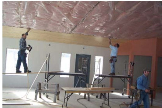
Delahunt Golf and Country Club, Holland

Delahunt Golf and Country Club Inc. New clubhouse building - $11,000, 2 Evening, 2 Share the Wealth Bingos