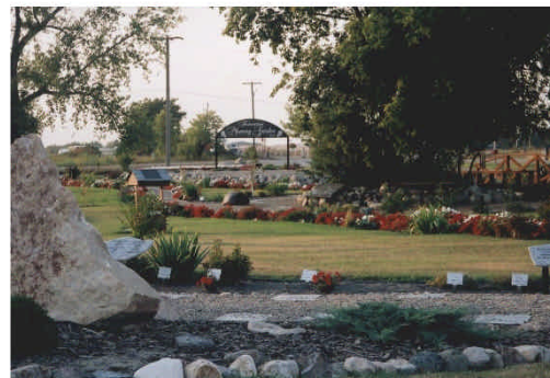
Foxwarren Memory Gardens

Foxwarren Memory Gardens Sprinkler system and lighting - $1,500, 1 Evening Bingo