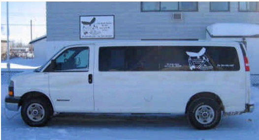
Lynn Lake Friendship Centre

Lynn Lake Friendship Centre Van purchase - $25,000