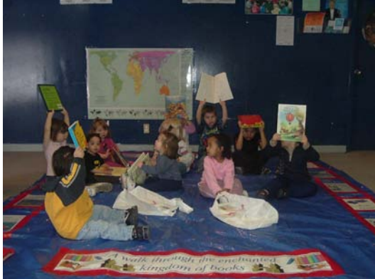
Kid Gloves Day Care Inc., Winnipeg

Kid Gloves Day Care Inc. Family literacy program, resources for lending library - $5,000