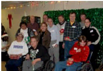
Manitoba Brain Injury Association

Manitoba Brain Injury Association Peer Support programs - $30,000