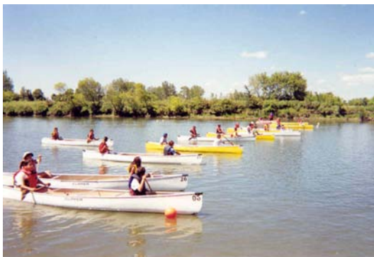
AKI Paddle Club, Wanipigow

AKI Paddle Club Canoes and equipment for youth program - $10,000