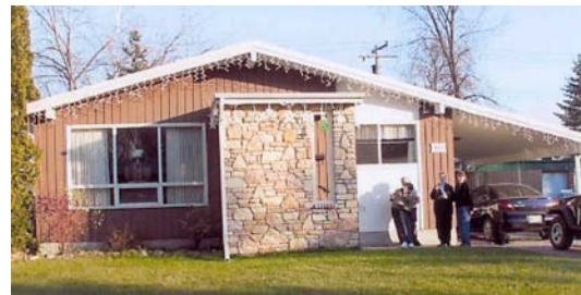
Prairie Places Inc., Winnipeg

Prairie Places Inc. Purchase new home - $8,000