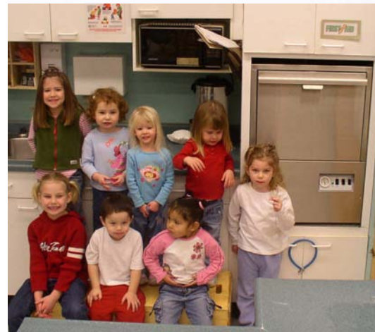
Assiniboine Kiddie Kollege Day Care, Brandon