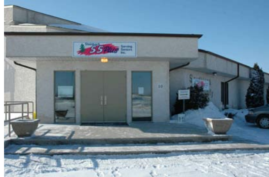
Steinbach Serving Seniors

Steinbach Serving Seniors, Inc. New facility - $9,000, 4 Evening Bingos