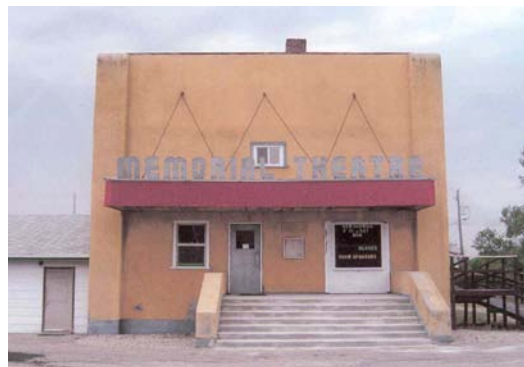
Reston Memorial Theatre