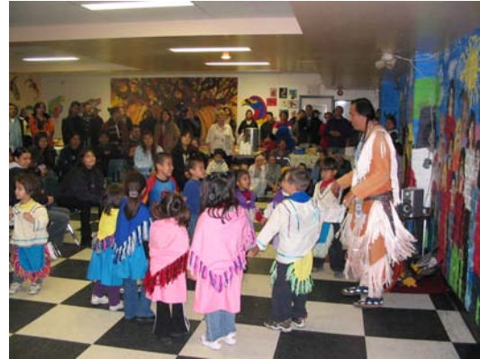
Andrews Street Family Centre, Winnipeg

Sakitowin program costs -$20,000, 3 Evening, 4 Share the Wealth Bingos