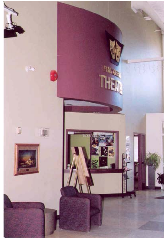
Prairie Players, Portage la Prairie

Lighting and dimmer system - $6,000, 4 Share the Wealth Bingos