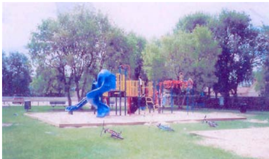
Daerwood School Parent Advisory Council, Selkirk

Playground development - $2,000, 1 Evening, 2 Share the Wealth Bingos