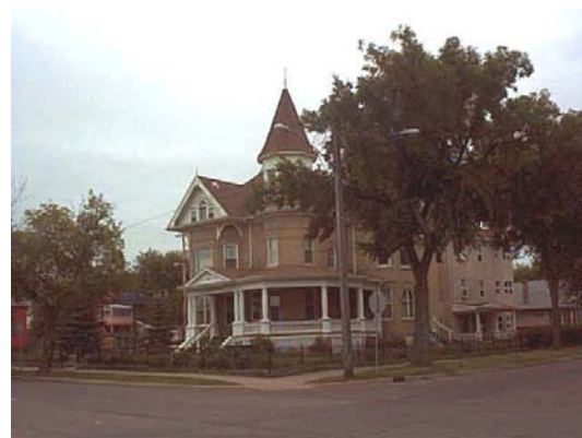
Brandon Community Welcome Cooperative Inc.