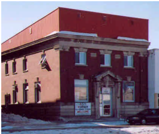
Kosy Korner Senior Centre Inc., Portage la Prairie

Kosy Korner Senior Centre Inc. Equipment and furnishings - $2,000