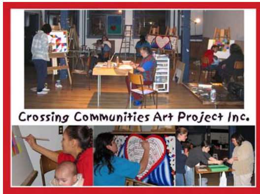
Crossing Communities Art Project, Winnipeg

Operating costs and building renovations - $25,000, 2 Evening Bingos