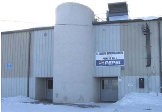
St. Adolphe Community Club

St. Adolphe Community Club Renovations to change rooms, washroom, office - $7,000, 1 Evening, 4 Share the Wealth Bingos