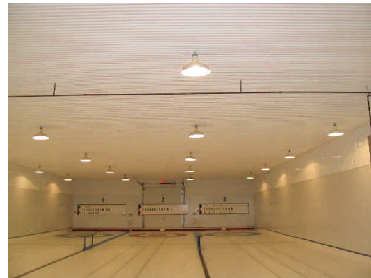
Treherne Community Curling Club Inc.

Roof and ceiling repairs - $6,000, 1 Evening Bingo