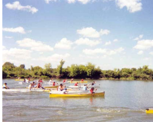
AKI Paddle Club, Wanipigow

Anola Community Club/Anola Soccer Committee Soccer field development - $2,000, 4 Share the Wealth Bingos