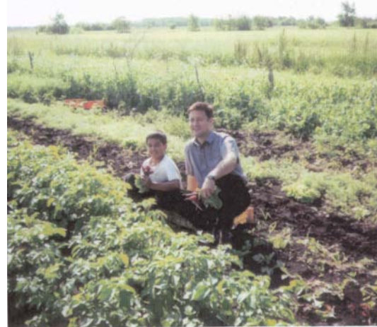
Earthshare Organic Co-op Inc., Winnipeg

Eriksdale Public Library Renovations - $12,000, 1 Evening Bingo