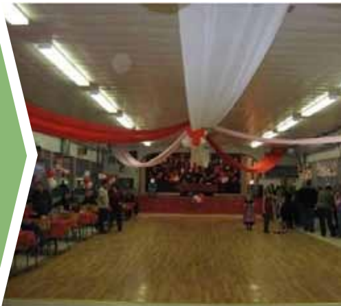
Ukrainian National Home of Vita