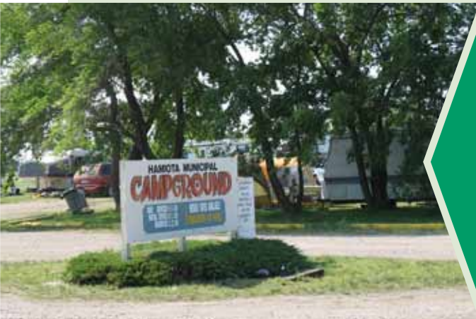
Hamiota Municipal Park

A certain number of bingo events are provided to MCSC by Manitoba Lotteries Corporation each year and these events are allocated to applicant groups.