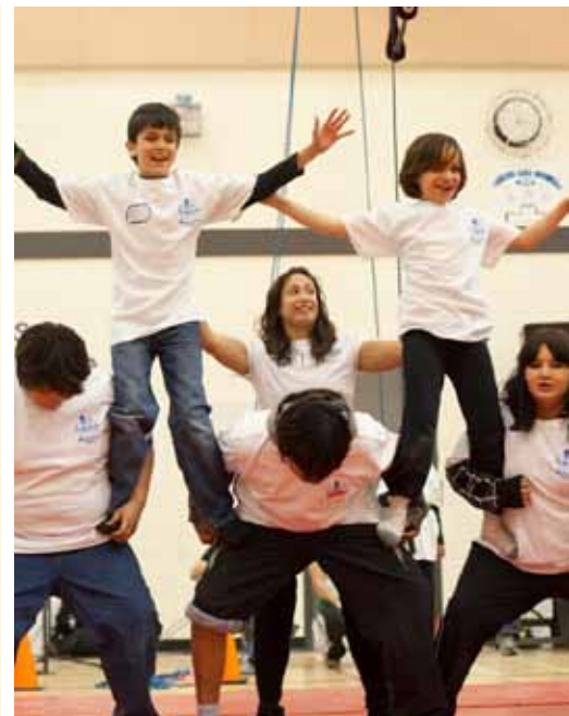
Winnipeg International Children's Festival Camp

“on behalf of the Morris Curling Club and the surrounding communities, I would like to thank Manitoba Community Services Council for their generous grant of $10,000 plus $6,000 in bingos to put towards the installation of new carpet in our facility. We recently held the “Canadian Mixed Curling Championships” in our club and received many great reviews on how great everything looked!”