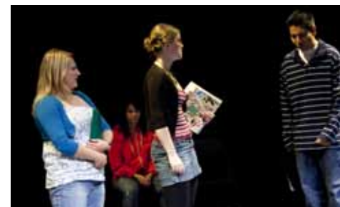
Sarasvati Theatre "No Offense"

Argyle Memorial Community Centre furnace, doors, windows - $2,000, 2 EVE