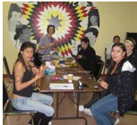
North End Women's Centre Inc.

Manitoba Council For International Cooperation (MCIC) MB rural outreach education programs - $12,000