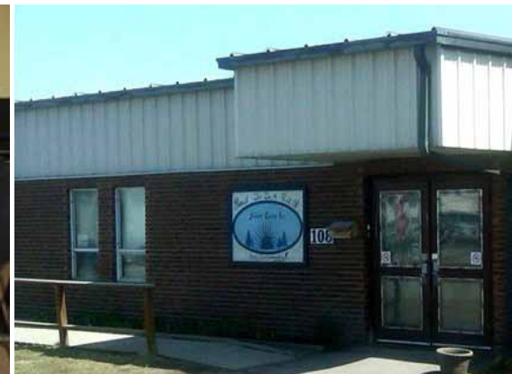
Juniper Centre, Inc.

Riverdale Place Workshop Inc. vehicle - $10,000