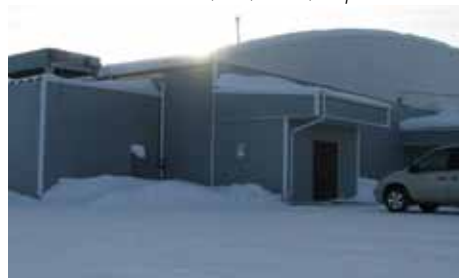
Gilbert Plains Recreation Centre

Phase 1 renovations - $5,000, 1 EVE, 2 E/L