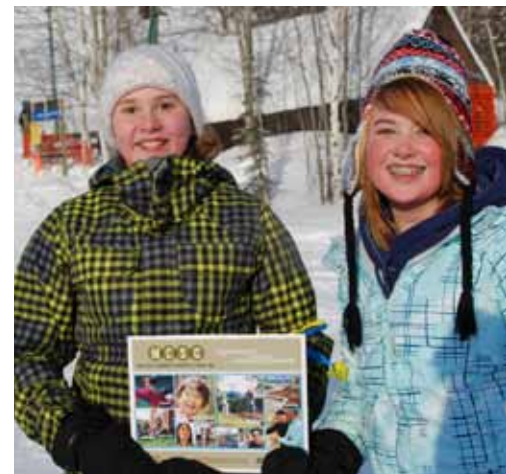
Thompson Ski Club, Inc.