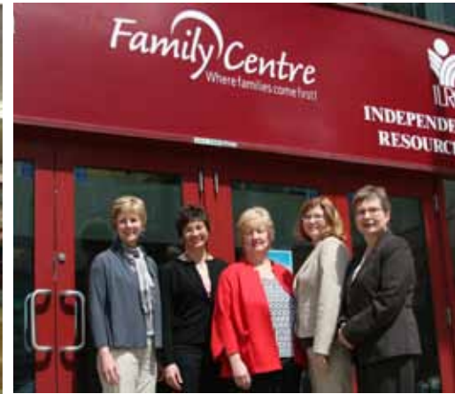
The Family Centre of Winnipeg