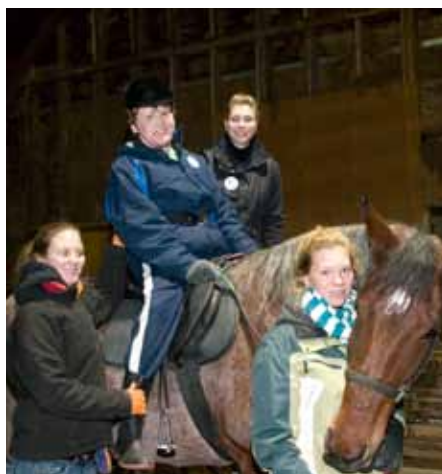
Manitoba Riding for the Disabled