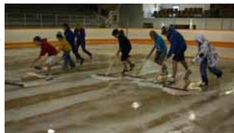
Nor-Mac Community Centre